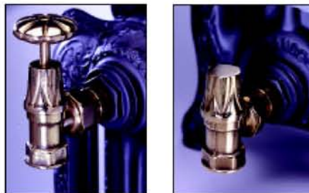
3/4" brass isolation and balancing valves acceptable for steam and water systems.